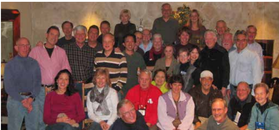
Vail December Long Trip Participants