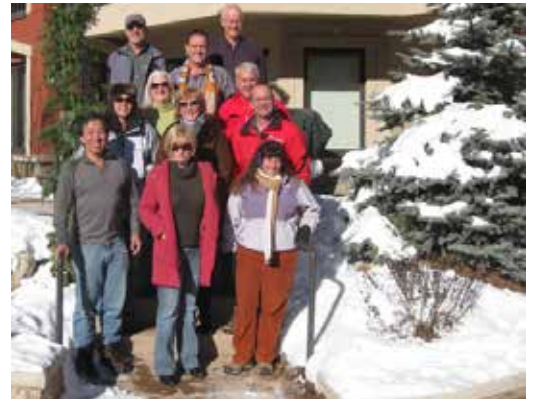
Vail December Short Trip Participants

McKenzie kept up their tradition of stopping by the fur store and trying