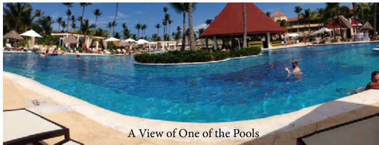
A View of One of the Pools