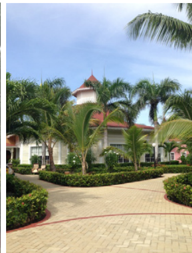
Two Views of the Grounds