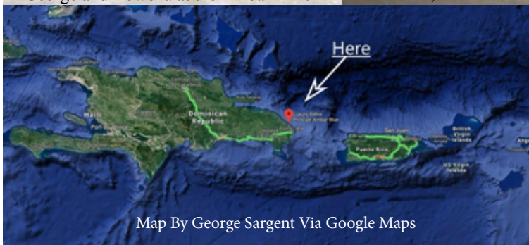
Map By George Sargent Via Google Maps

Join the Space City Ski and Adventure Club at one of the best beach adventures in the world. Travelers will be rewarded with your first Mamajuana* (customary and a must try) or a cocktail of your choice upon arrival at the Luxury Bahia Principe Ambar . Okay. That's a long name so I'll just call it the Ambar. The Bahia Principe is a mega resort including multiple locations catering to the whims of patrons from around the world. The Ambar is a secluded section for adults only yet Ambar patrons may visit other areas of the resort. TripAdvisor reviewers give the Ambar a 4.5 rating out of 5. I've been there and it is a nice place!