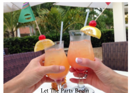
Let The Party Begin

**Airfare: The ski club is offering this trip as a land only package at this time. The intent is to offer a group airfare package for those wishing for the club to make those arrangements. I will support you either way whether you wish to book your own or to take advantage of the group airfare. Southwest is my preferred Airlines although I may check with others. I've talked to the Southwest Airlines group department and the agent suggested airfares for our May 2019 departure may not be available until October or early November. Relax. That's still about 6 months out from our travel date. For now, I'll make a list of names interested in the group airfare. The airfare price above is strictly an estimate although it is an actual airfare price for February and March 2019.