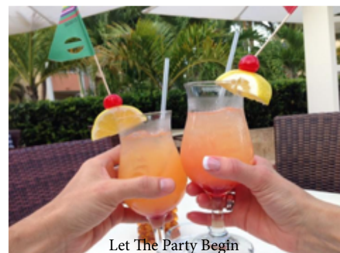
Let The Party Begin

**Airfare: The ski club is offering this trip as a land only package at this time. The intent is to offer a group airfare package for those wishing for the club to make those arrangements. I will support you either way whether you wish to book your own or to take advantage of the group airfare. Southwest is my preferred Airlines although I may check with others. I've talked to the Southwest Airlines group department and the agent suggested airfares for our May 2019 departure may not be available until October or early November. Relax. That's still about 6 months out from our travel date. For now, I'll make a list of names interested in the group airfare. The airfare price above is strictly an estimate although it is an actual airfare price for February and March 2019.