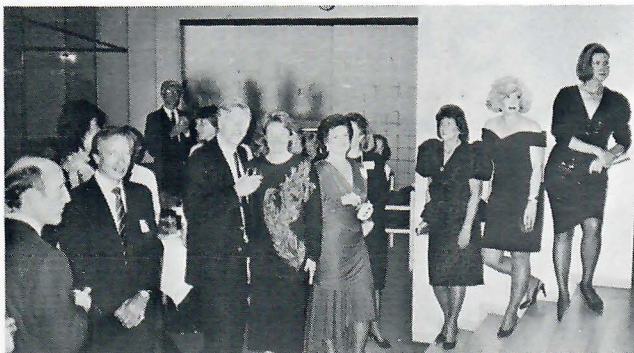
"Putting on the Ritz".