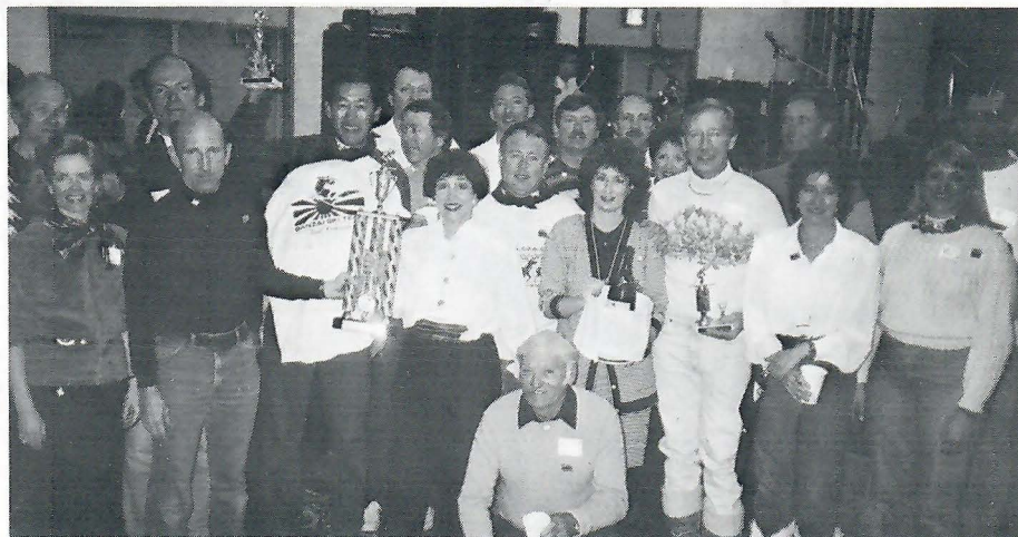
VAIL — TSC Thanksgiving Turkeys who won a metal for SCSC. P.S. SCSC won 1st in our division.