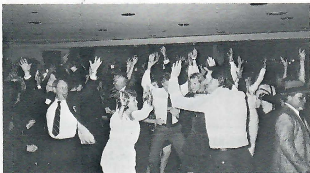
"We surrender", aka "Shout"!