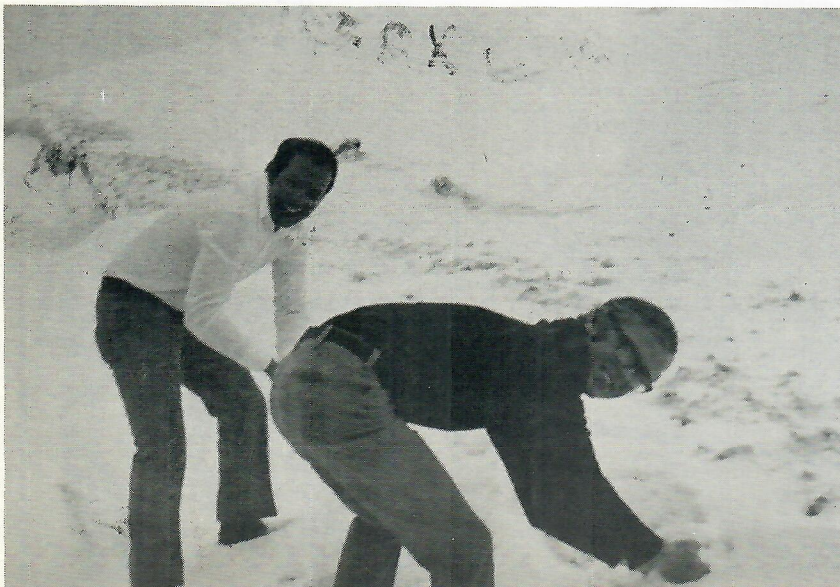
Snow Cones anyone? (with Scotch) . . . of course!