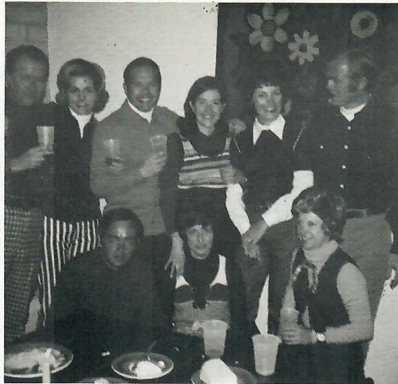
Apre' Ski Camaraderie