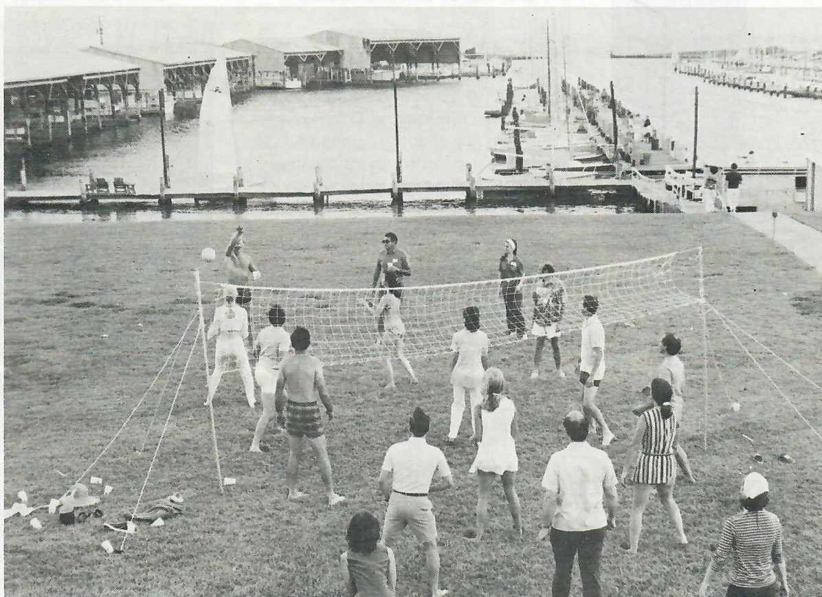
THE ACTIVE PEOPLE HAVE ALL THE FUN!