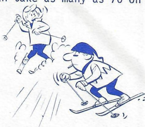
A standing skier shall check for approaching downhill skiers before starting.