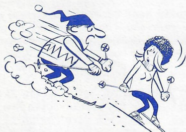
When skiing downhill and overtaking another skier, the overtaking skier shall avoid the skier below him.