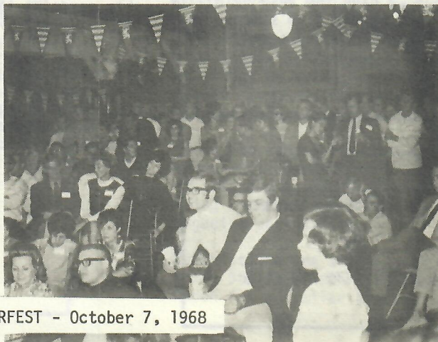
SPACE CITY SKI CLUB'S OKTOBERFEST - October 7, 1968