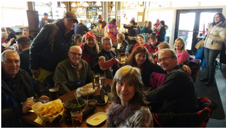
ner at Element 47.