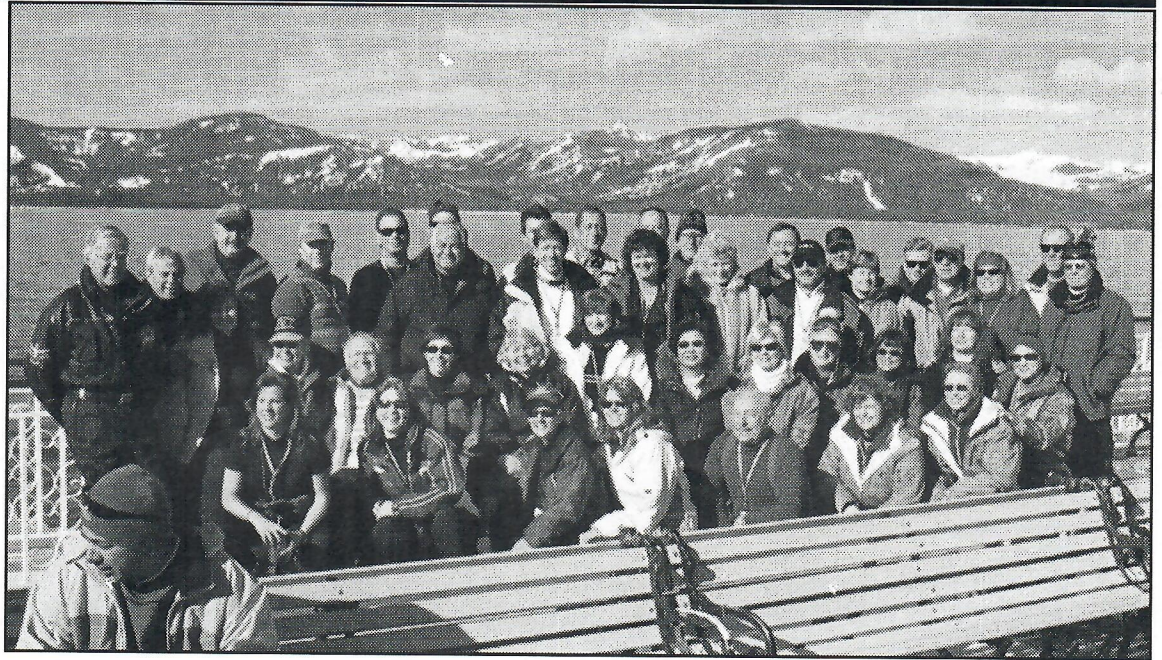
First Place Group Photo: "Tahoe Queen Group"