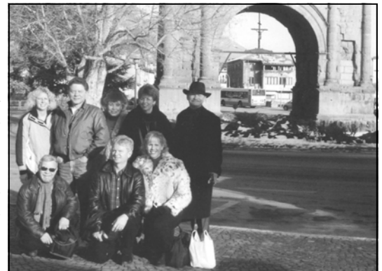
Augustus Arch in Aosta Italy Founded by Romans 25 AD

We had daily opportunities to explore the Alpine regions as well as other countries. Our first tour took us into Aosta, Italy, where monuments from the Roman period are still standing in the center of town. After a guided tour through the cobblestoned streets of the old town, a relaxing lunch