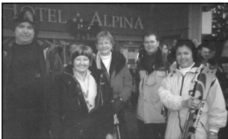
Ready to go skiing