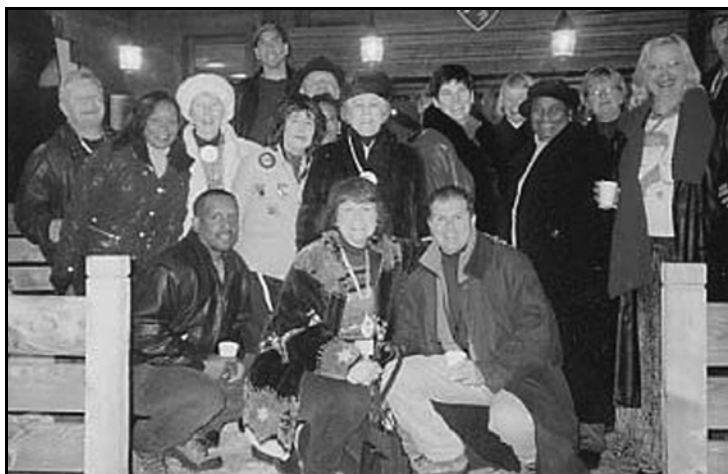
Group enjoying the welcome to Chamonix Party