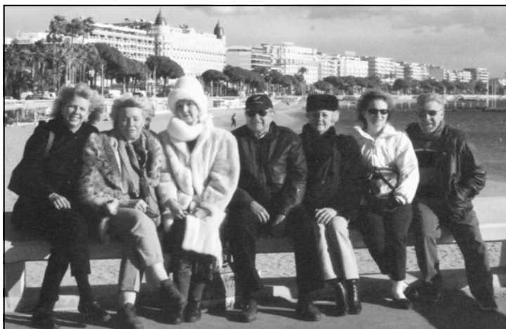
Enjoying the beach in Cannes on the French Riviera