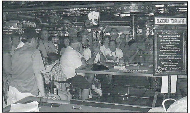
TSC Cruise-Vail Resorts Hosted a Great Blackjack Tournament