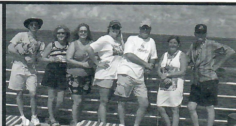
Scenes from the Texas Ski Council 2004 Caribbean Cruise