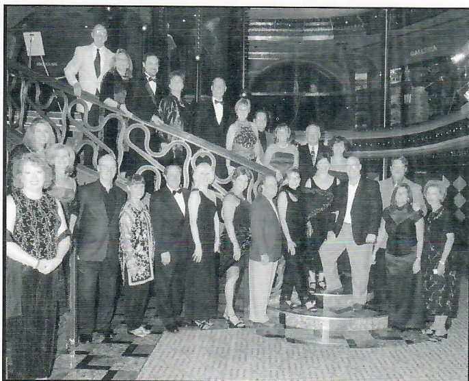
Formal Night in the Grand Atrium