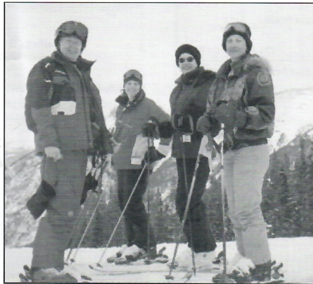
A great day at Copper