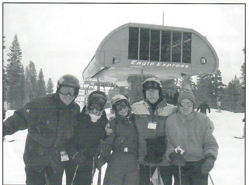
Mammoth Mountain 2006