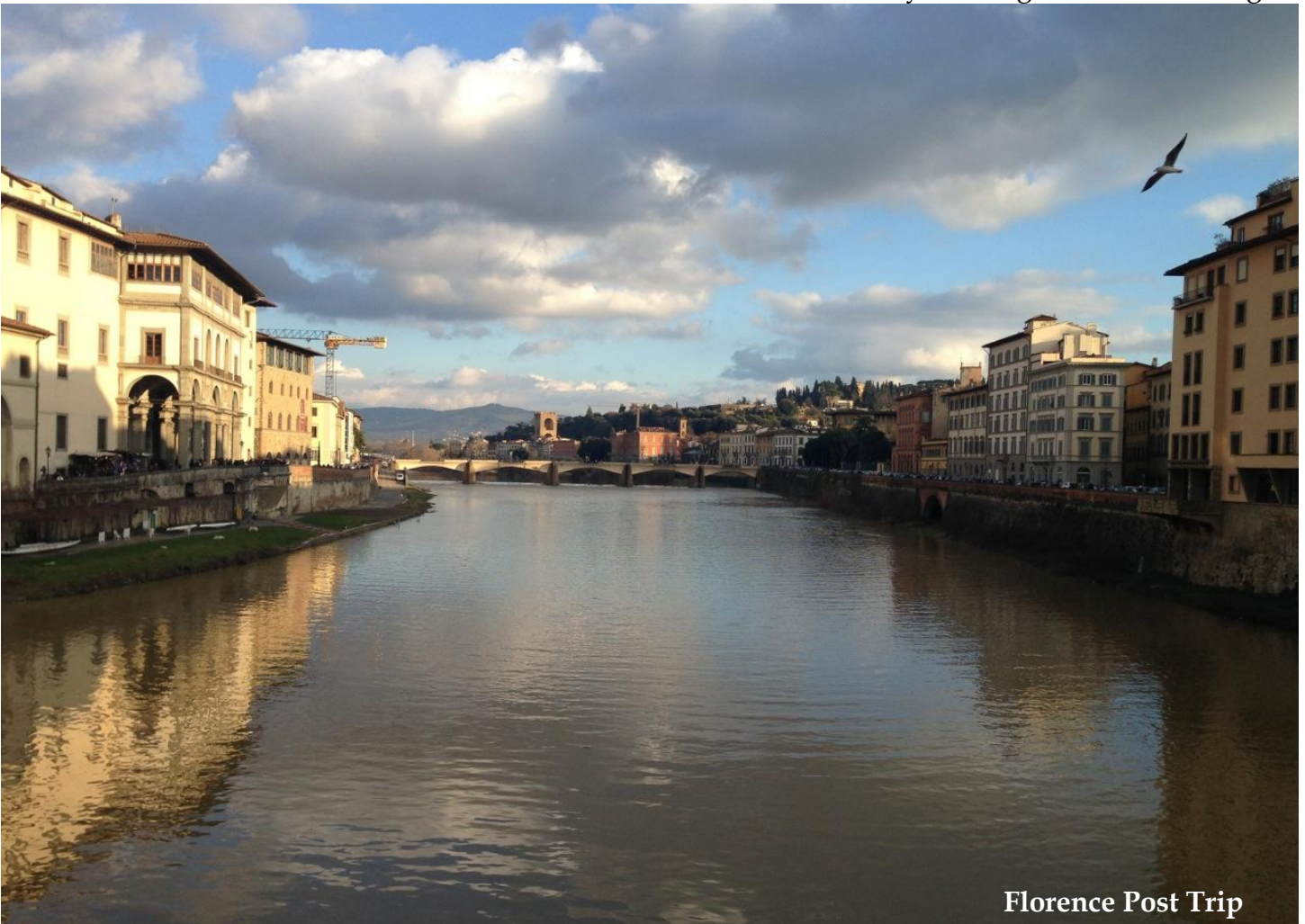
Florence Post Trip