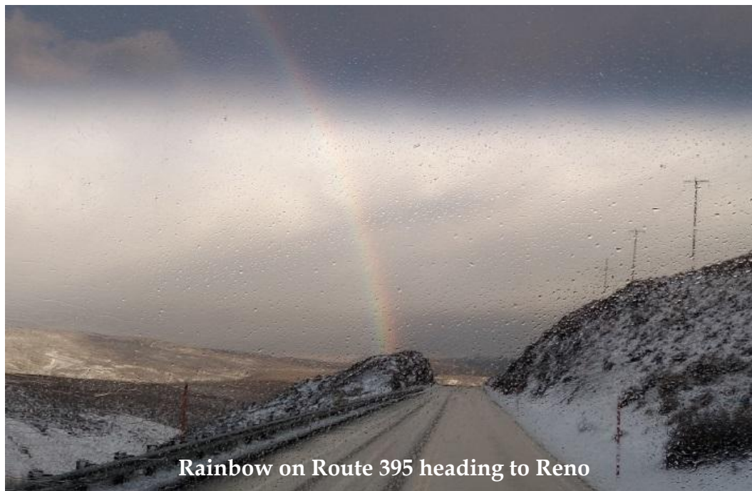
Rainbow on Route 395 heading to Reno