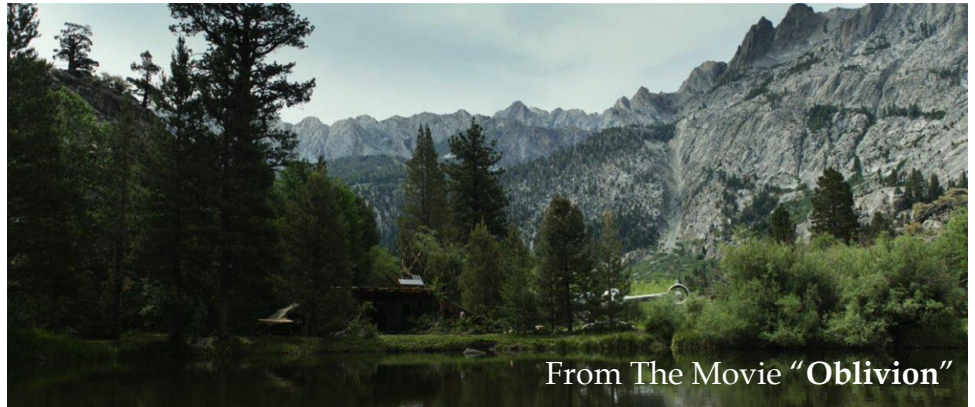
From The Movie "Oblivion"

Mono Lake was EERIE. It is an alkali, salty lake, with no outfall. It loses all of its water due to evaporation. The City of Los Angeles has been taking water from the streams that feed Mono Lake for years, so its volume has shrunk dramatically. In order to save the lake and the many bird species that live on an