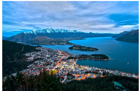
View of Queenstown from Gondola

It seems a shame to travel all the way down under and not take advantage of a few other popular destinations such as Sydney, Australia. Sydney is a much publicized and photographed city with the famed Opera House, Harbor, bridge, and Crocodile Dundee. Well, maybe not that last character! You will have a chance to explore the city during our 3 night stay in Australia at the Holiday Inn Old Sydney.