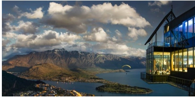
Skyline Gondola restaurant

Another evening we will ride the historic steamship TSS Earnslaw across Lake Wakatipu to the Walter Peak ranch for dinner and a sheep shearing program.