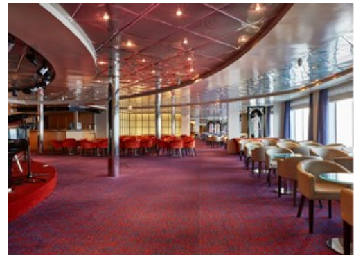
CRYSTAL SHIP LOUNGE & BAR AREA**

Optional half day Athens Markets walking tour or full day tour to My-