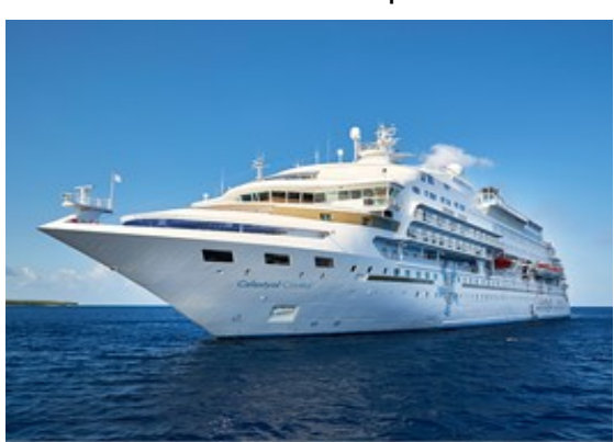
cenae and Epidaurus.

Half day tour in Cape Sounion w/ English speaking guide