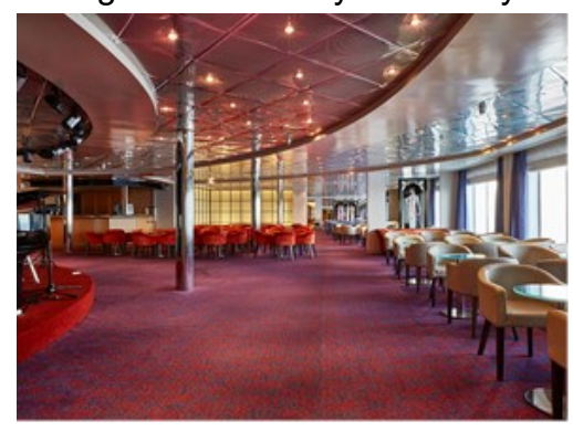
CRYSTAL SHIP LOUNGE & BAR AREA**

Optional half day Athens Markets walking tour or full day tour to My-