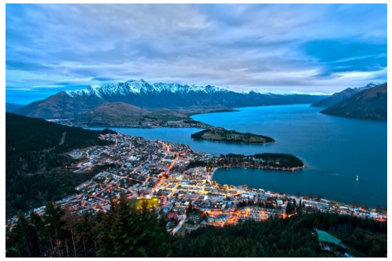
View of Queenstown from Gondola photo from TSC Brichure

It seems a shame to travel all the way down under and not take advantage of a few other popular destinations such as Sydney, Australia. Sydney is a much publicized and photographed city with the famed Opera House, Harbor, bridge, and Crocodile Dundee. Well, maybe not that last character! You will have a chance to explore the city during our 3 night stay in Australia at the Holiday Inn Old Sydney.