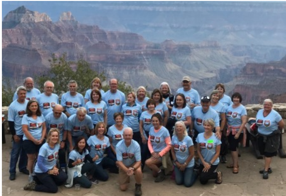
Group picture on the back deck of the North Rim Lodge just before a dinner in the dining room.

After waiting over two years since this trip was originally planned in the Fall of 2019, the rescheduled trip from September 2020 finally happened. 32 participants took a 900 mile round trip from Las Vegas to Zion National Park, to the North Rim Grand Canyon, around to the South rim Grand Canyon and then back to Las Vegas. Along the way they had an opportunity to see the beauty of both National Parks and some behind the scenes spots not normally found unless you know the secrets.