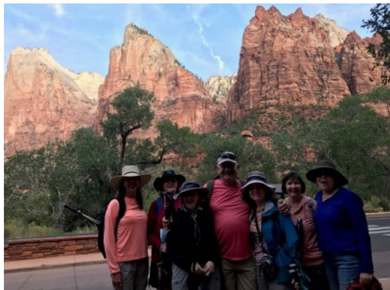
Group with the three mountains, Court of the Patriarchs.