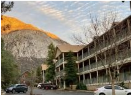
Yosemite View Lodge