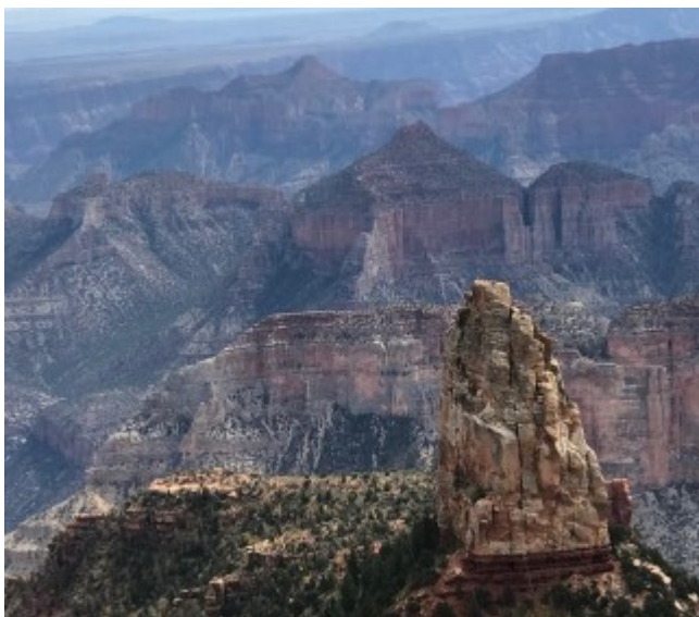
Mt. Haden at Point Imperial

Day 6: Walked across the pedestrian viewing bridge at Hoover Dam that was built in 2010. Played Pickleball at Bally's where we spent the night in LV. Later in the evening went downtown to the Freemont Experience and gambled.