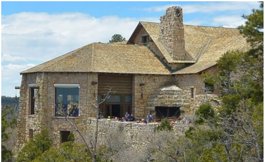
North Rim Lodge with back Balcony overlooking the Canyon

Happy group on the back balcony of the North Rim Lodge. Perhaps a few adult beverages before dinner?